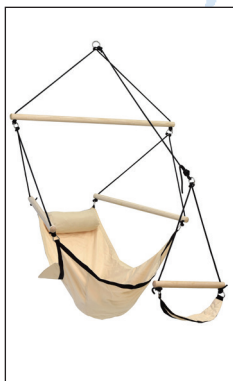
Sand • AZ-2030560 EAN 4030454000871