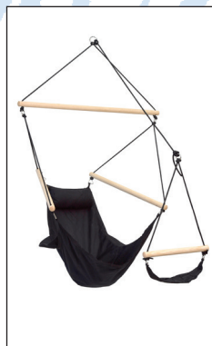
Black • AZ-2030580 EAN 4030454000505