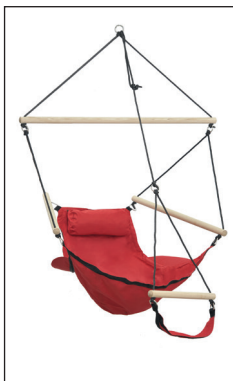
Red • AZ-2030520 EAN 4030454000857